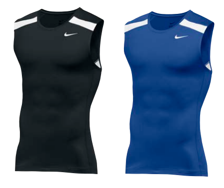
012 Black/White/(White) 494 Royal/White/(White)

Dri-FIT spandex sleeveless speed top that wicks sweat for dry/cool comfort. Fitted body led design, all seams were placed to allow athletes to move freely with zero distraction and mobility. Contrast self fabric inset power speed design aesthetic for elevated race day look. Designed for use of the recreational runner to the elite athletes for training or competition. Body width: 18.5", Body length: 28" (size large).