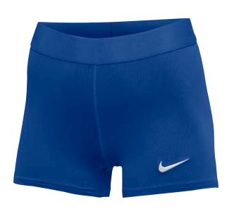
(White) 493 Royal/(White)